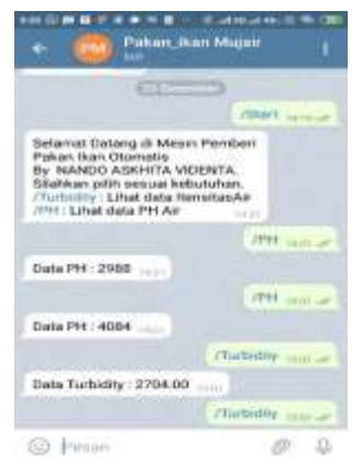
Figure 5. The reply to the sentence ph

Testing This test is carried out to find out all inputs and outputs run as expected. First, connect all the circuits together, if the indicator light on the Esp 32 board flashes for 2 times, the Esp 32 board has been connected to Wifi. The Ph sensor will activate the pump when the water in the pool is not neutral. If the adc value is more than -2,000 then the pump will be active which will flow the neutralizing water. To see the adc value, you must send the "/PH" command. The following is the adc value sent via the Telegram application Figure 5