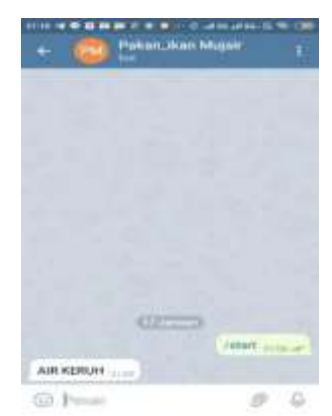
Figure 6. Reply when the water is cloudy

Turbidity Sensor for its output only sends a notification if the pool water is cloudy at 200 and 40 then the user will receive a notification of cloudy pool water. Here the user receives a notification when the water is cloudy at 100 Figure 5.