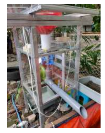
Figure 4. Prototype of the design Hardware

that have been successfully made in this study are the Arduino and Telegram-based Mujair Fish Feed Design. The prototype of this tool is as shown in Figure 3