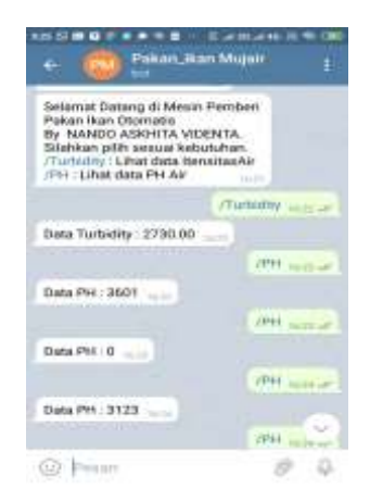
Figure 7. Replies to the sentences of Turbidity

Servo Motor and Blower run every 07.00-12.00-14.00. When the Servo Motor and Blower are active they will be active for 30 seconds. The following Servo Motor opens the feed valve Figure 7.