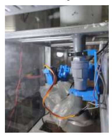
Figure 8. Servo Opens Valve

Servo Motor and Blower run every 07.00-12.00-14.00. When the Servo Motor and Blower are active they will be active for 30 seconds. The following Servo Motor opens the feed valve Figure 7.